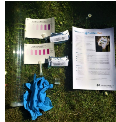
What you will be looking for: